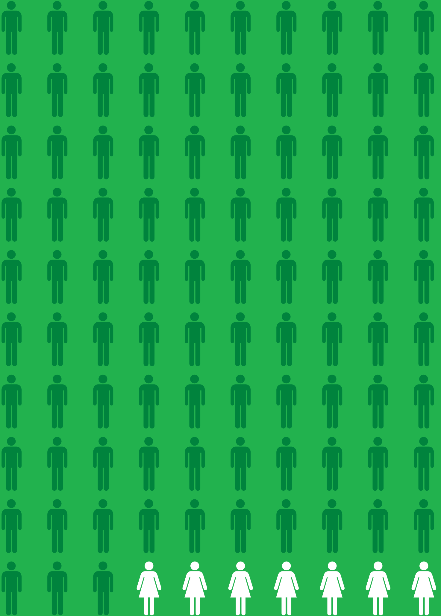
FTSE 100 executive directorships, 93.4% men. 6.6% women.